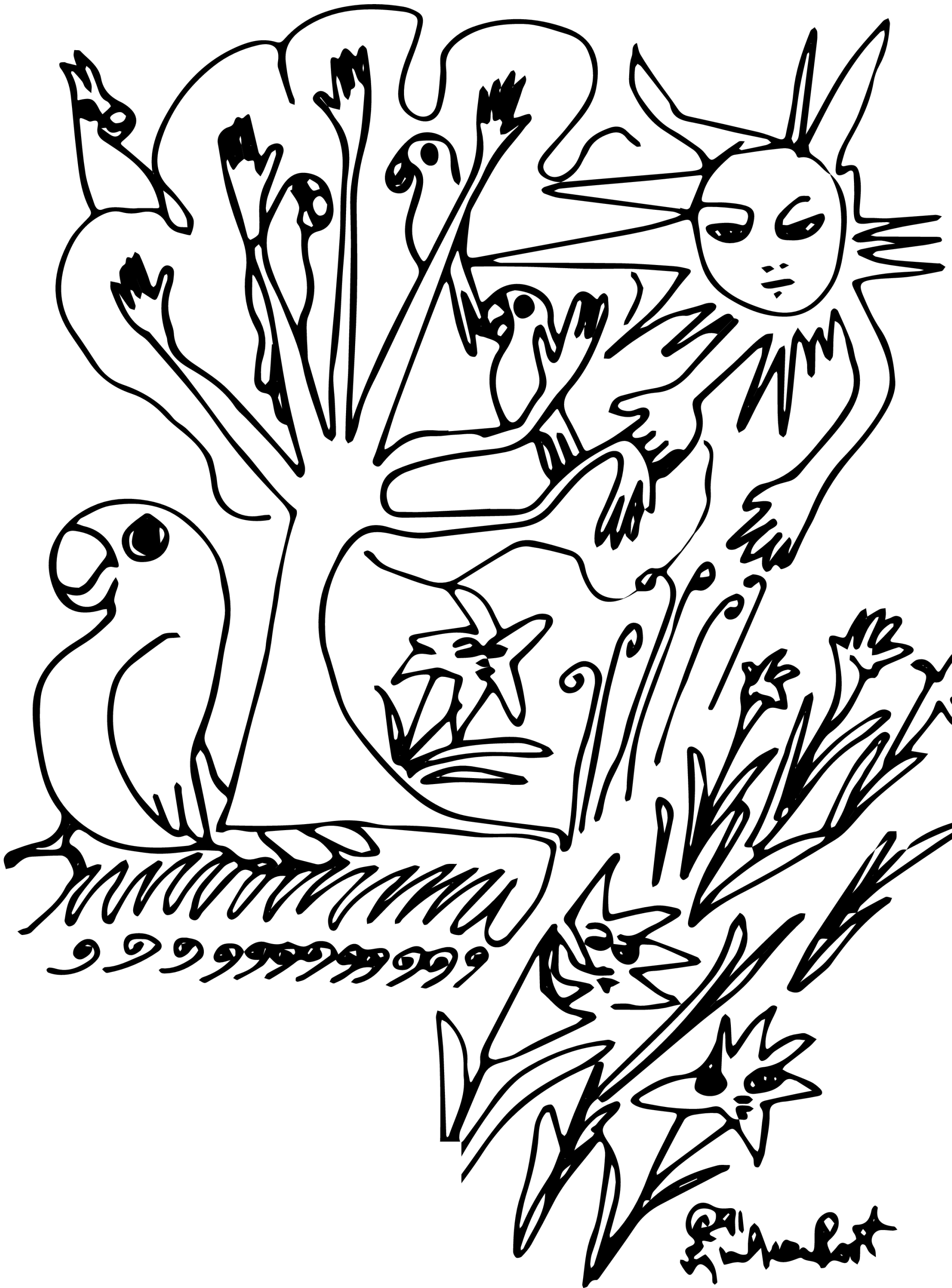
Lynn Green Root, untitled, 1991, felt-tip marker on paper, 14 1/8 x 11 in., Purchase, with funds from Joshua Green, 2003.091