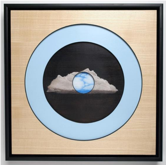
Critz Campbell, Landscape Memory 2